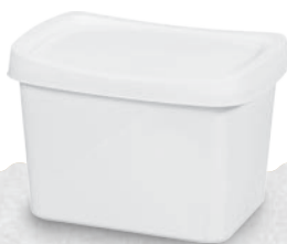
Spread Container PP