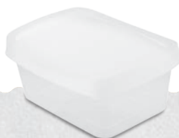
Spread Container PP