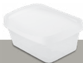
Spread Container PP