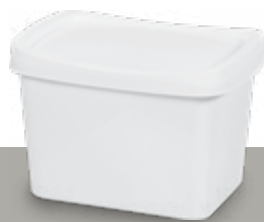
Spread Container PP